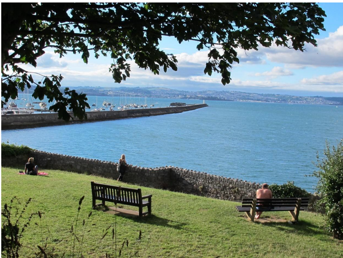
E4 – 8: Jubilee Gardens, Berry Head Road.

E4 – 8: Jubilee Gardens. Commanding irreplaceable panoramic views across the Bay, this small area of garden is much used by tourist and resident alike as an enclave of peace and tranquillity in close proximity to Breakwater Beach and the Ranscombe area of the town.