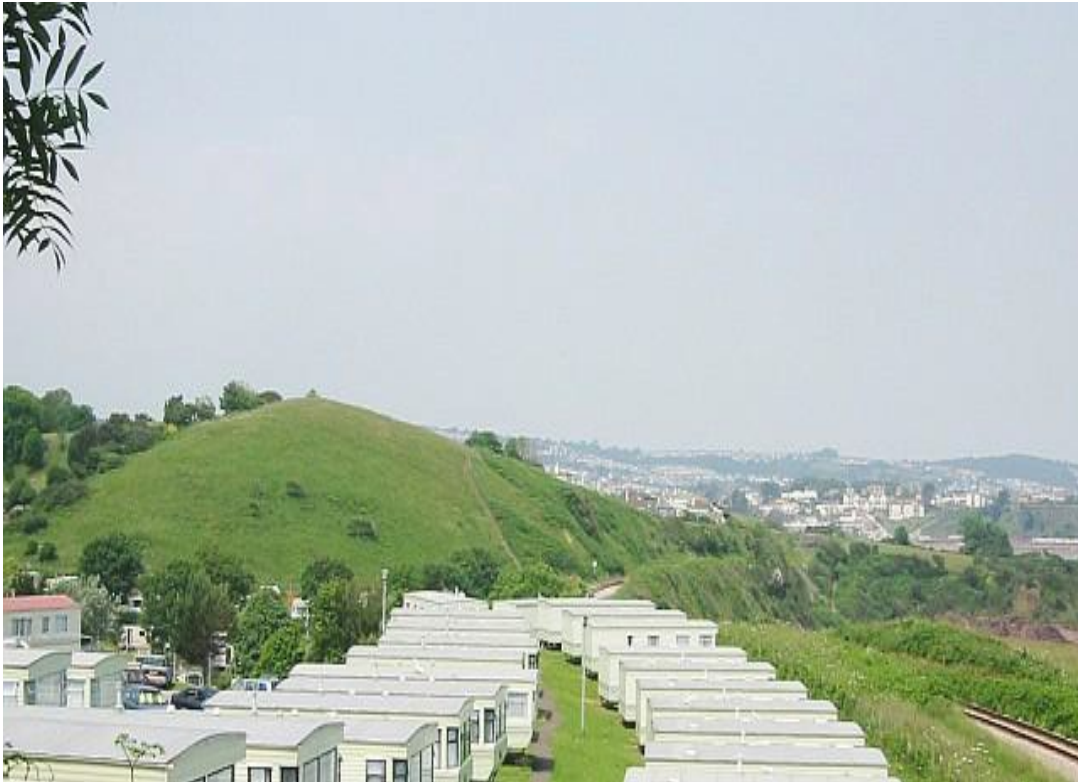
E4 – 17: Sugar loaf Hill and caravans at Waterside.

E4 – 16: Sugar Loaf Hill. A renowned landmark, vantage point and amenity open space situated to the south of Goodrington beach, traversed by the South West Coast Path, and adjacent to the South Devon Steam Railway Line and Saltern Cove Local Nature Reserve (LNR). Its unique conical shape is attributable to its past as a volcanic vent and it sits in a highly important geological area. It is also defined as an Other Site of Wildlife Interest (OSWI) and an Urban Landscape Protection Area (it is bounded by housing on three sides) in the Local Plan.