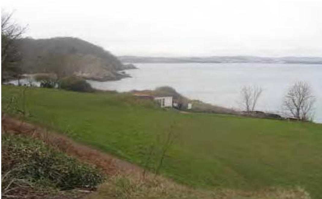
E4 –3: Battery Gardens.

E4 – 3: Battery Gardens. A site of great historical importance as well as aesthetic, natural and ecological value, home to the Brixham Battery Heritage Centre and coastal defences built in 1940. The whole area also commands stunning views across Torbay and to the west to Churston Cove to which it connects via the South West Coast Path.