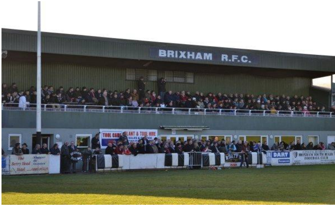
E4 – 2: Astley Park, home to Brixham Rugby Football Club.

E4 – 3: Battery Gardens. A site of great historical importance as well as aesthetic, natural and ecological value, home to the Brixham Battery Heritage Centre and coastal defences built in 1940. The whole area also commands stunning views across Torbay and to the west to Churston Cove to which it connects via the South West Coast Path.