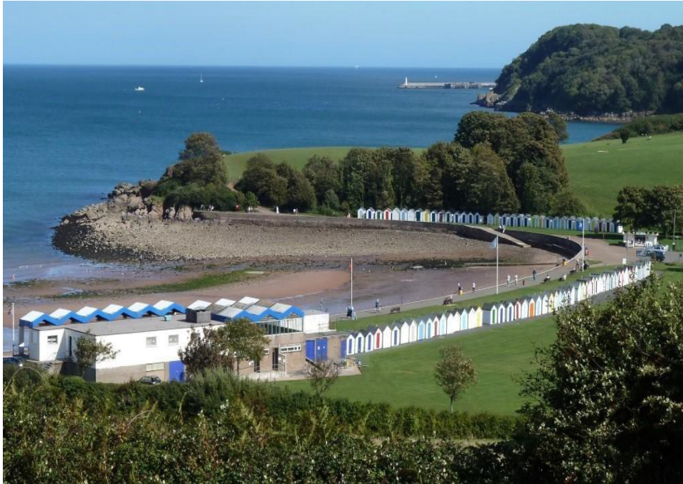
E4-14: Broadsands beach with the Elberry grassy headland behind the row of trees, which leads to Elberry Cove and beach.

E4 – 15: Warborough Common. This area of unmanaged rich calcareous grassland has been Common Land since 1604. It is prized by locals and visitors for its recreational, historical and ecological value, it functions as the gateway to Galmpton. It boasts natural beauty and outstanding views.