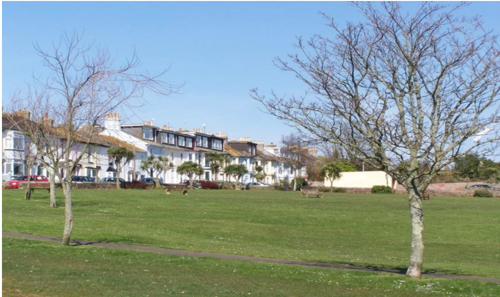
E4 – 7: Middle Green Furzeham.

E4 – 8: Jubilee Gardens. Commanding irreplaceable panoramic views across the Bay, this small area of garden is much used by tourist and resident alike as an enclave of peace and tranquillity in close proximity to Breakwater Beach and the Ranscombe area of the town.