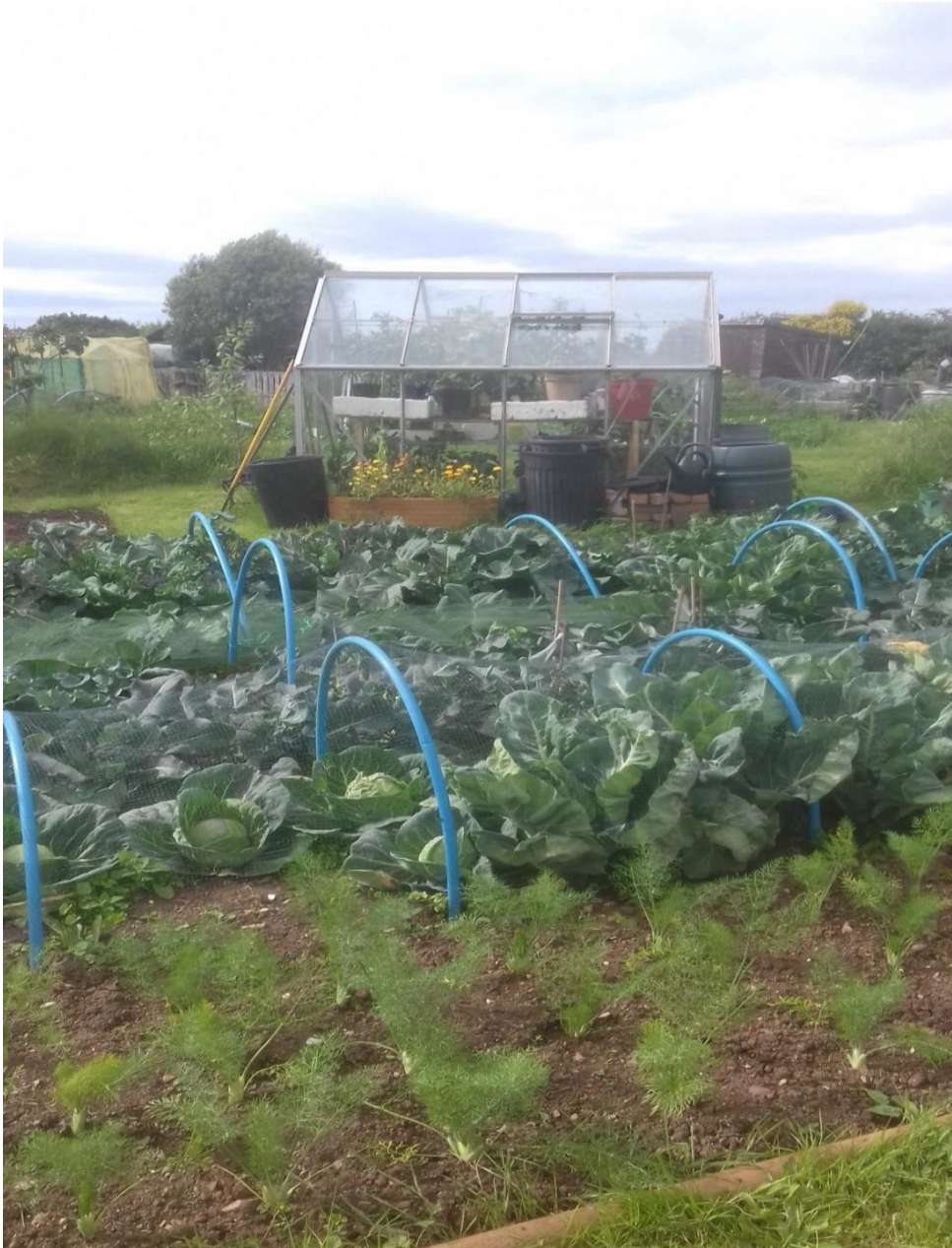
E12 – 4: Stoney Park Allotment Gardens.

E4 – 12: Stoney Park Allotments. Founded by a charity set up in 1912, this allotment for “The Labouring Poor” of Brixham has been managed ever since by trustees of the Charity. While the primary purpose of the site is vegetable growing with approx. 50 plots (a waiting list currently exists), the site also contains a wide range of “micro-habitats”, including hedges, dry stone walls and two ponds.