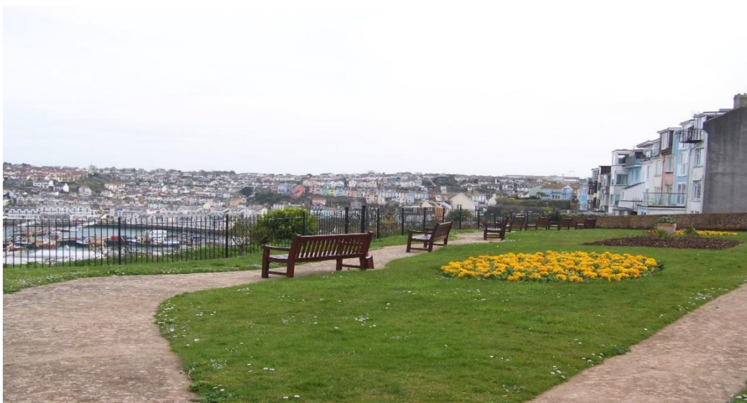
E4 – 5: Bonsey Rose Gardens.

E4 – 5: Bonsey Rose Gardens. A small area of cultivated garden treasured by all due to its cliff-edge position which commands incomparable stunning views across Torbay.