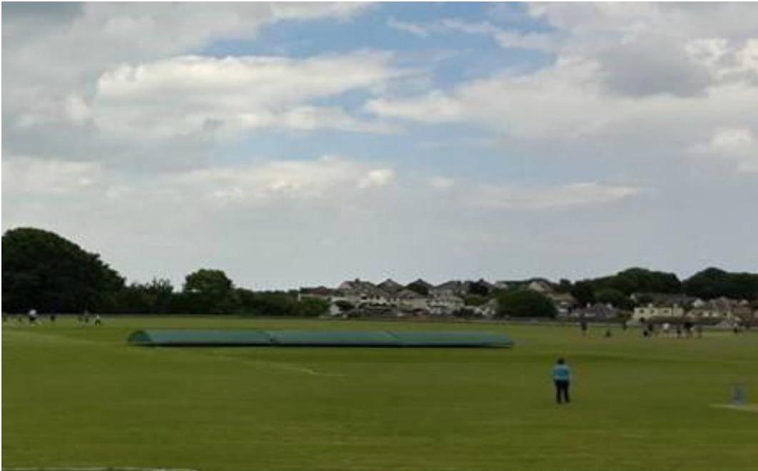
E4 – 6: Brixham Cricket Club Ground.

E4 – 6: Brixham Cricket Ground. Occupying a unique location on specially levelled ground, a scarce resource in or around the Town Council boundary, the new home to a thriving cricket club which was founded in 1934. Its facilities are used by local schools and youth organisations as well as match play, the ground also being used for family fun days and other community activities.