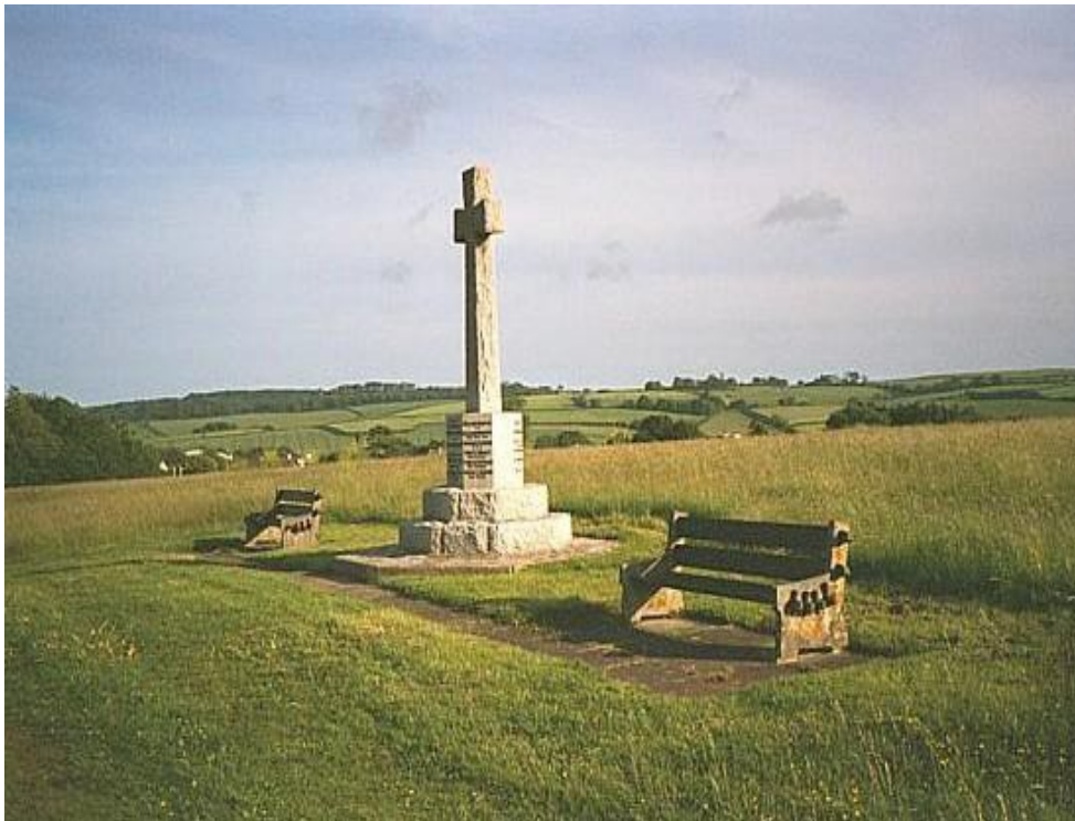
E4 – 15: Galmpton Warborough Common and the War Memorial.

E4 – 15: Warborough Common. This area of unmanaged rich calcareous grassland has been Common Land since 1604. It is prized by locals and visitors for its recreational, historical and ecological value, it functions as the gateway to Galmpton. It boasts natural beauty and outstanding views.