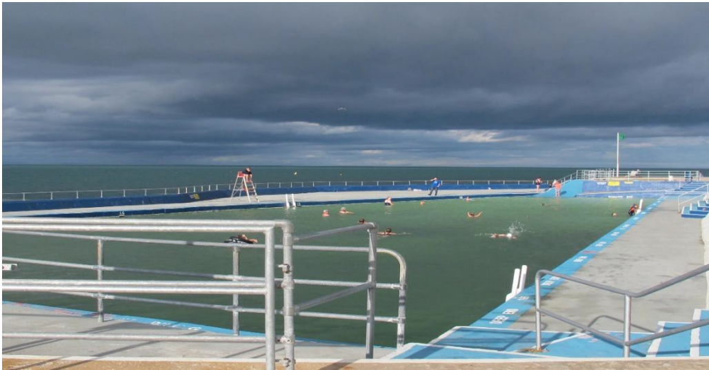
E4 – 9: Shoalstone Pool.

E4 – 9: Shoalstone. This area surrounds a stunning “Art Deco” icon of the South Devon coastline, Shoalstone Pool. This has been a much used recreational amenity for locals and visitors alike since its construction in 1926. Throughout its history, its survival has been entirely dependent on practical and financial support from generations of local communities, none more than today where its very existence owes itself to massive community support.