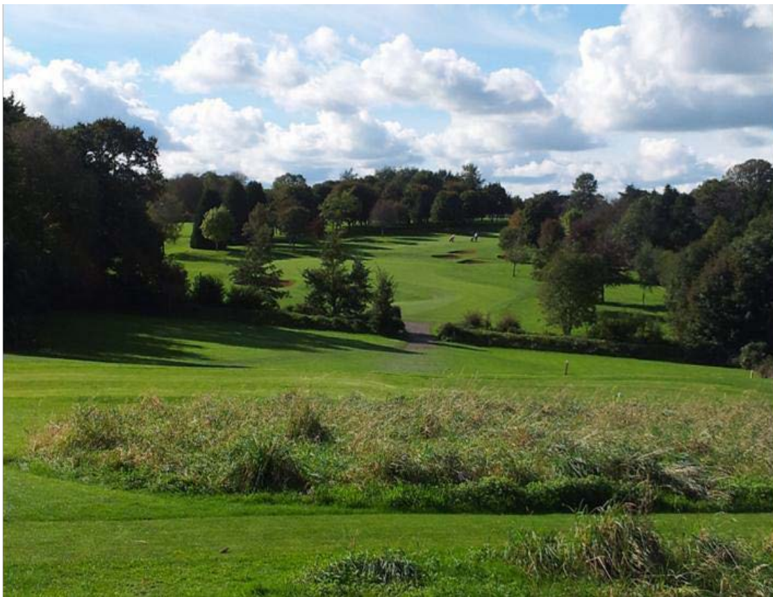
E13 – 4: Fairways across Churston Golf Course.

E4 – 13: Churston Golf Course. Founded in 1890, subsequently re-designed by the great Harry Colt, Churston Golf Course is of international importance to the sport, of enormous landscape value, commanding irreplaceable panoramic views and harbouring a wide array of flora and fauna including several protected species. Of huge value to golfers, naturalists, casual walkers as well as being of exceptional amenity value to all, including those tackling the South West Coast Path which delineates its seaward boundary.