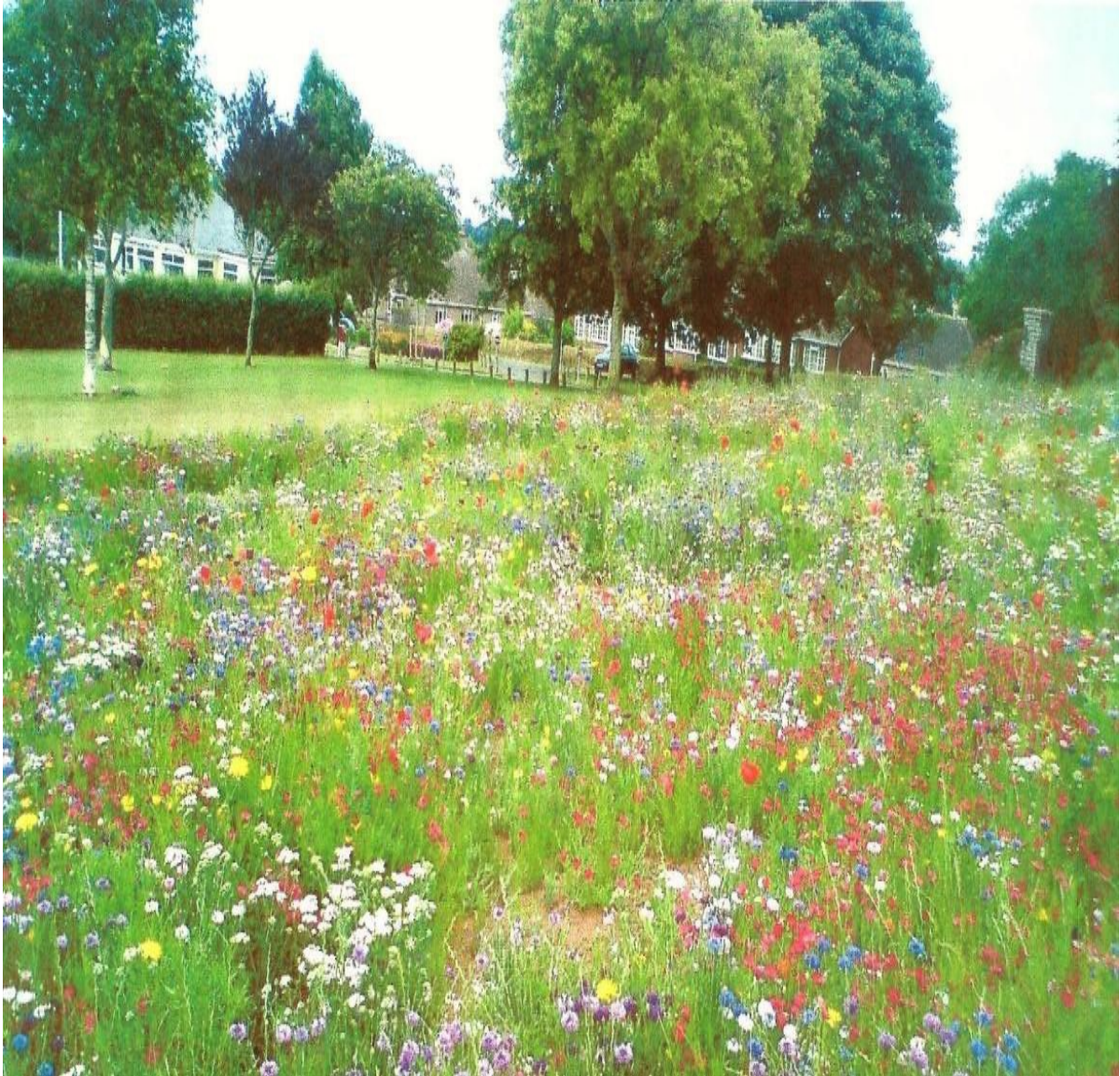
E4 – 11: St. Mary's Park Wild Flower Meadow.

E4 – 11: St Mary's Park. Adjoining the Higher Brixham Conservation Area, commanding panoramic views across the town towards the sea, this much-used park is the most important recreational area in Higher Brixham. Comprising sports field, bowling club, tennis courts and outdoor exercise equipment, it is used by members of the community of all ages. It also hosts the annual Hap'nin music festival, a well-established community organised event that could not be sited elsewhere.