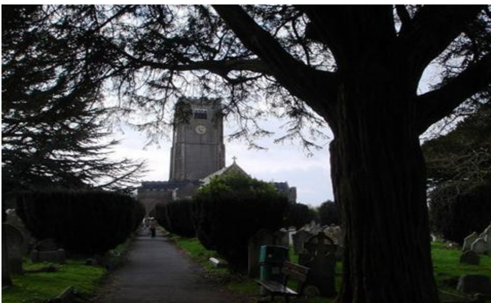
E4 – 10: St Mary's Church and Churchyard.

E4 – 10: St Mary's Churchyard. A site of huge community importance and historic value used daily as an area of peace, tranquillity and reverence to families of those buried there.